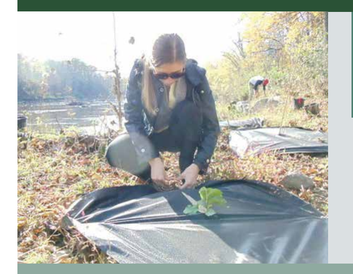
Weed mats have a "shiny" side and a "rough" side.

\star The shiny side of the mat should always face up. \star