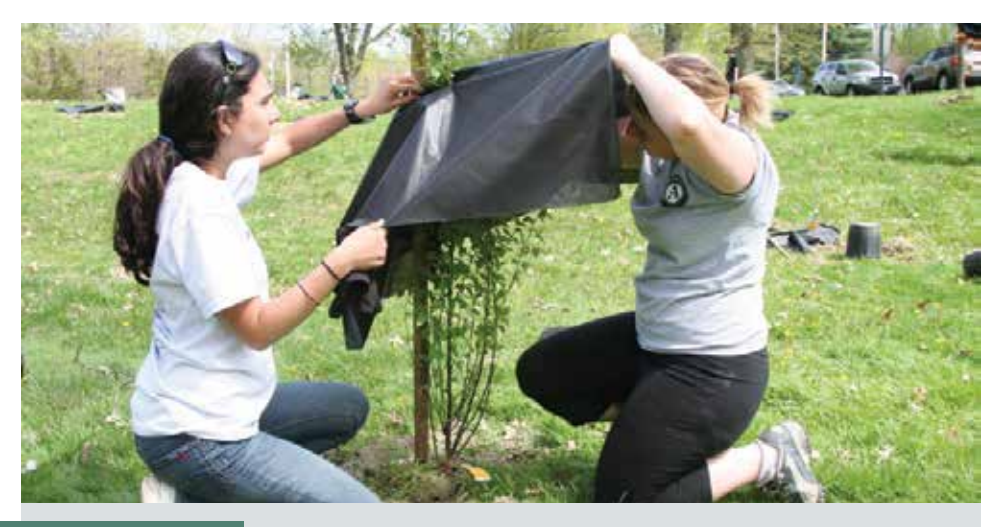
2. Gently guide the plant through the slit in the center of the mat.

\star The shiny side of the mat should always face up. \star