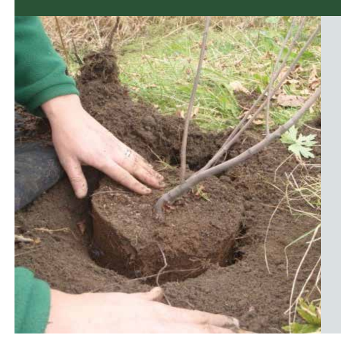
5. Check that the soil from the pot is level with the ground.